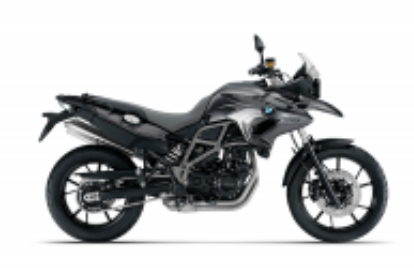
F 700 GS + $0.00