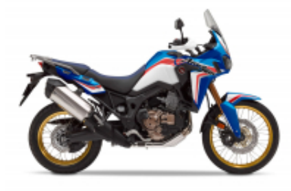
Africa Twin CRF 1000 L + $450.00